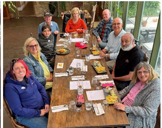
After lunch we visited the Cooma Car Club's magnificent museum, dedicated to classic cars and memorabilia.