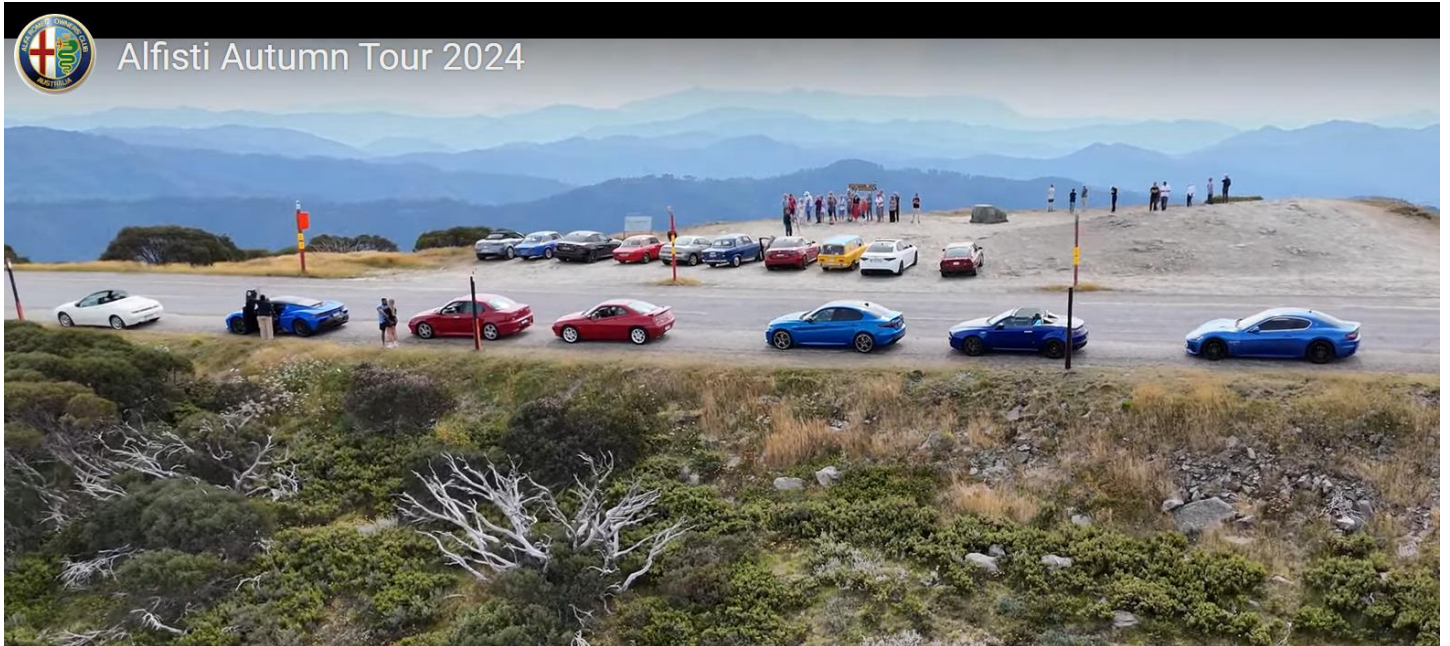
Danny's Lookout from Aidan's drone

But some chose not to venture across the road to the Danny's Lookout "car park"!