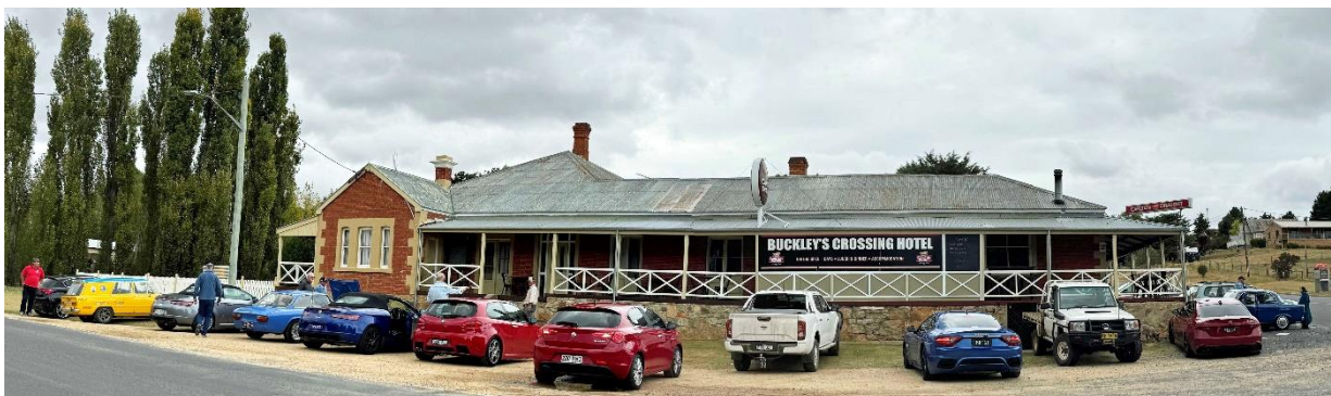
Alfisti paying homage to the deity in Dalgety

Then we embarked on a back roads route via Dalgety (which could have been the location of the Nation’s Capital – but obviously it wasn’t to be!) and on to the Travellers Rest – our lunch spot - just south of Cooma.