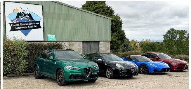
From Cooma, we headed for Canberra, an hour and a bit away. The focus then for most of the Tour participants that had made it this far was preparation for Auto Italia on Sunday.