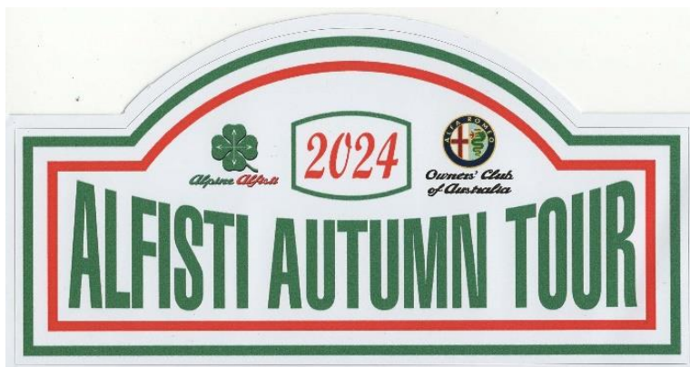
The 2024 Tour sticker!

Monday 1 st April to Friday 5 th April 2024