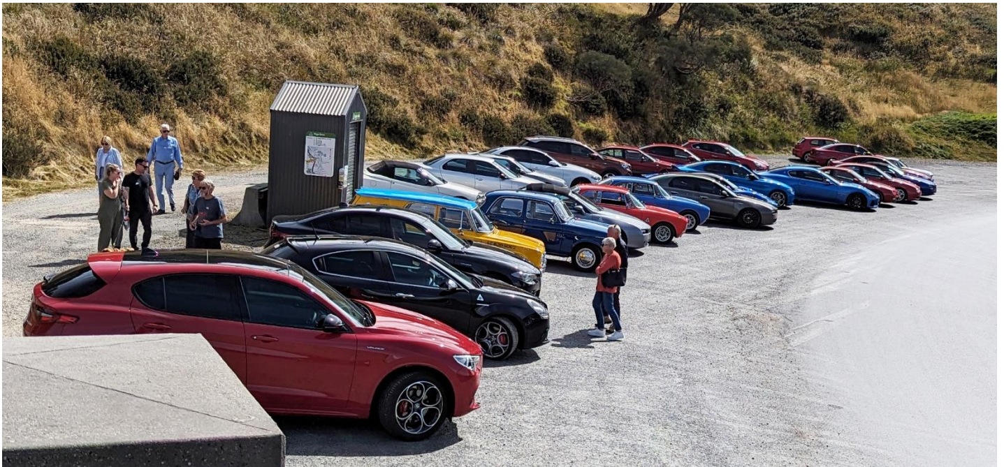
Alfisti @ Hotham Heights

From Swifts Creek the Tour headed through Omeo (but no stopping here today as it was the tail end of the Omeo Rodeo and the town was still a rather busy!) and on to Hotham Heights for lunch at The General.