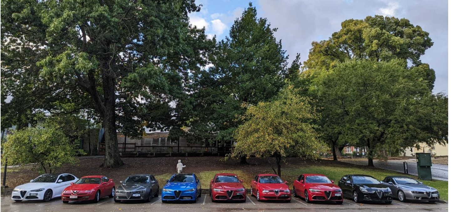
Some of the Alfas below the Riverdeck Kitchen in Bright

After gathering for breaky at the Riverdeck Kitchen in Bright - a popular venue on many a recent Tour - we headed back east towards Mt Beauty, over Tawonga Gap and then joined the Kiewa Valley Highway heading north. We followed the Kiewa River before doubling back along the normally aptly named Happy Valley Road to Myrtleford. This road is windy and undulating, travelling through a mix of farming country and native forest, taking you back to the Ovens Valley where we rejoin the Great Alpine Road westward to Myrtleford. When you have the road to yourself, Happy Valley Road is a very pleasant drive – even for the navigator.