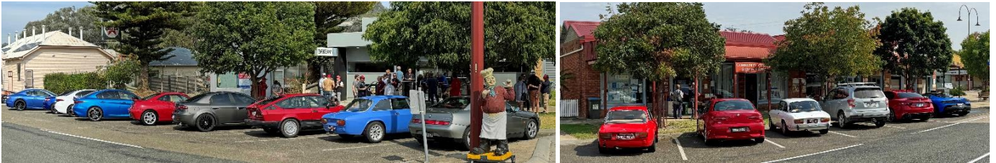
Alfisti line-up in Swifts Creek

Day 1 | Monday 1 st April | Lakes Entrance to Bright: Into the mountains and over the top! After a mid-morning start from Lakes Entrance, the Tour followed the Great Alpine Rd, stopping first at Swifts Creek Bakery for coffee & cake and an opportunity to stretch the legs before tackling Mt Hotham.