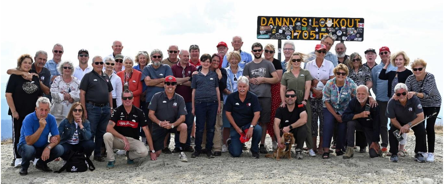
The 2024 Alfisti Autumn Tour participants at Danny's Lookout