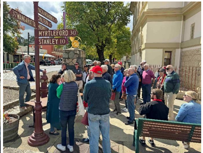
Clockwise: the Beechworth Post Office; Giulia QV vs a Beechworth gutter; the Beechworth Briefing

After lunch, the revellers met at the Monument adjacent to the roundabout in the main street of Beechworth at a pre-appointed time – for yet another briefing. This time it was for the group to decide on the route to take that afternoon.