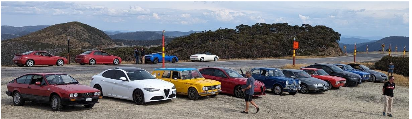
Ground level view @ Danny's Lookout