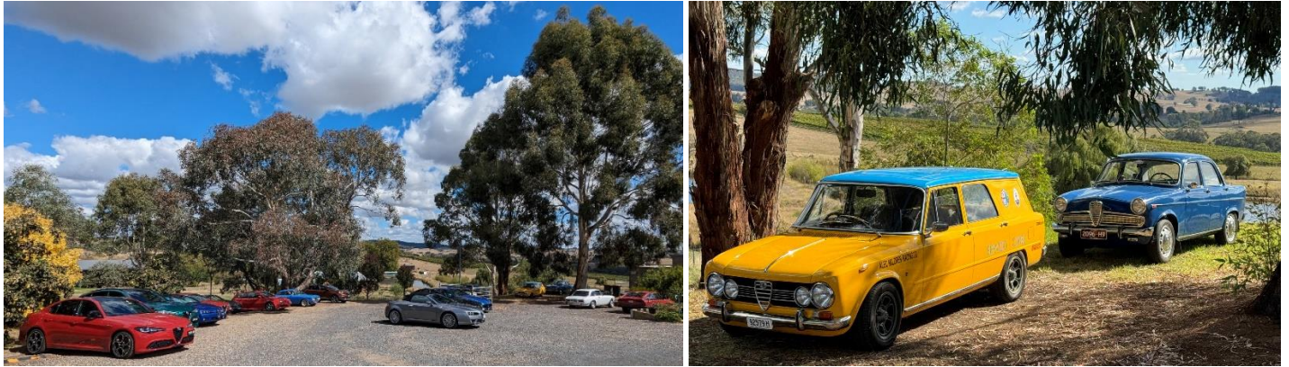
Some of the Tourists at Courabyra ...

After a brief stop at the Southern Cloud Memorial – we were running late! – we bundled ourselves back into our chariots and headed for Courabyra, a beautiful little winery/restaurant just north of Tumbarumba.