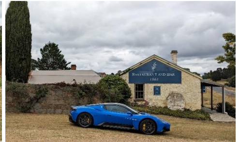
Alfisti at Travellers Rest and an errant Alfiste who forgot to bring an Alfa – any of them!