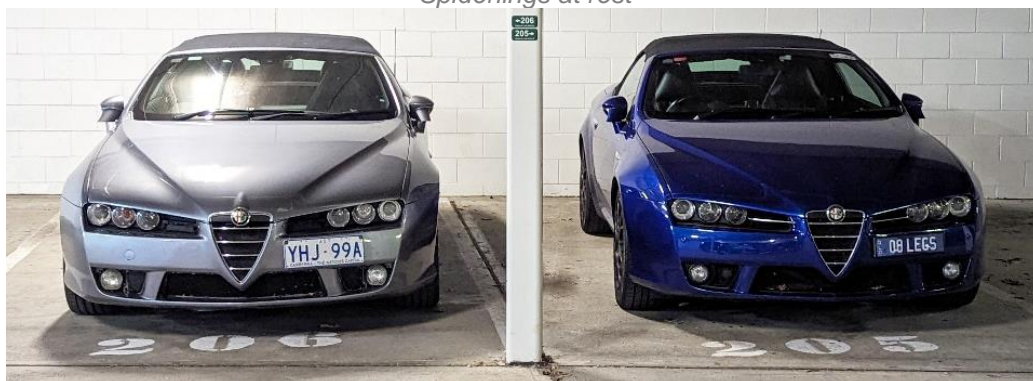
Spiderlings at rest

From Hotham, it was pretty much all downhill along a tight and twisty road to Harrietville, then on to Bright for our first night's stop-over.